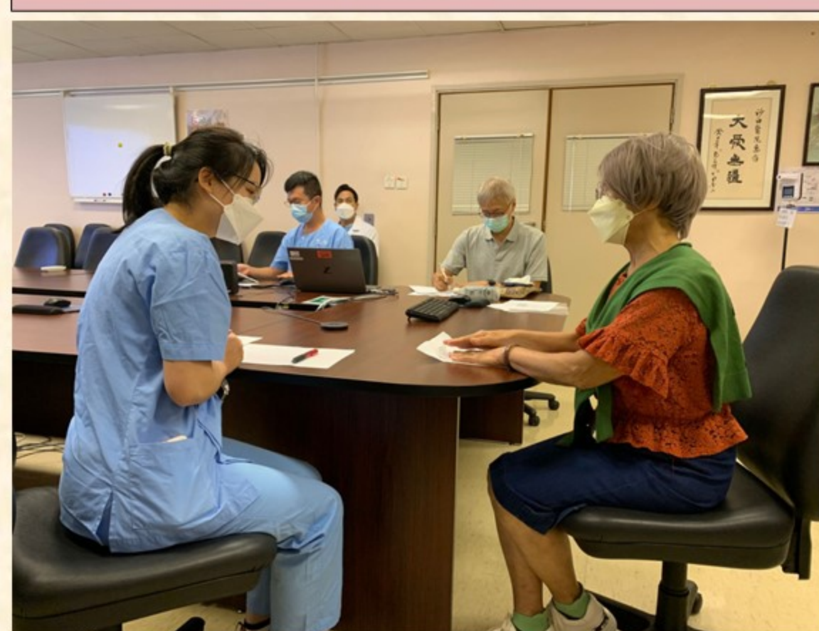
Simulation training sessions on ACP for doctors